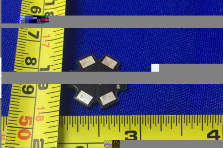
Fig. 1 - Overall view of the sample